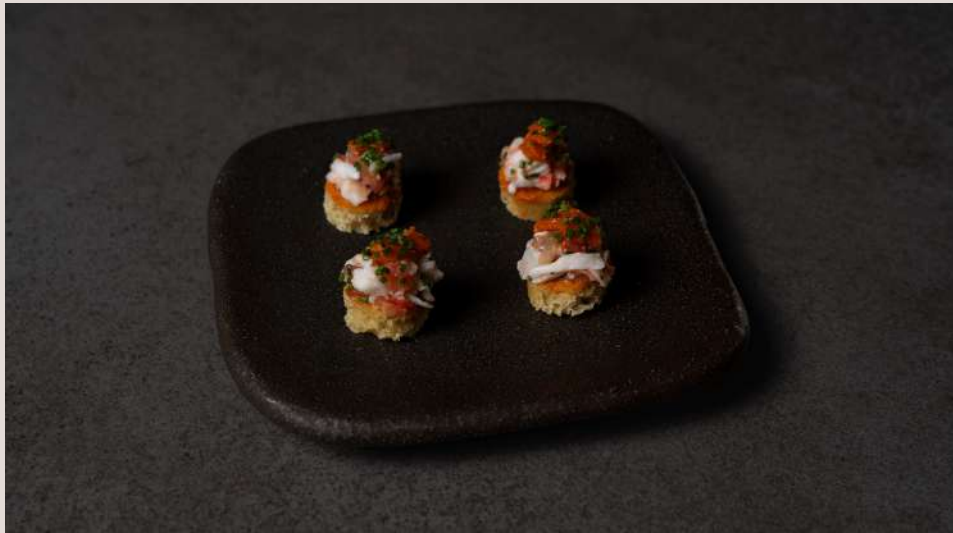
King Crab Crumpet, Hot Tomato Butter