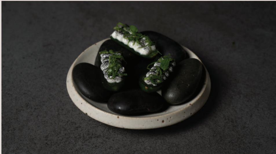
Compressed Cucumber, Smoked Labne