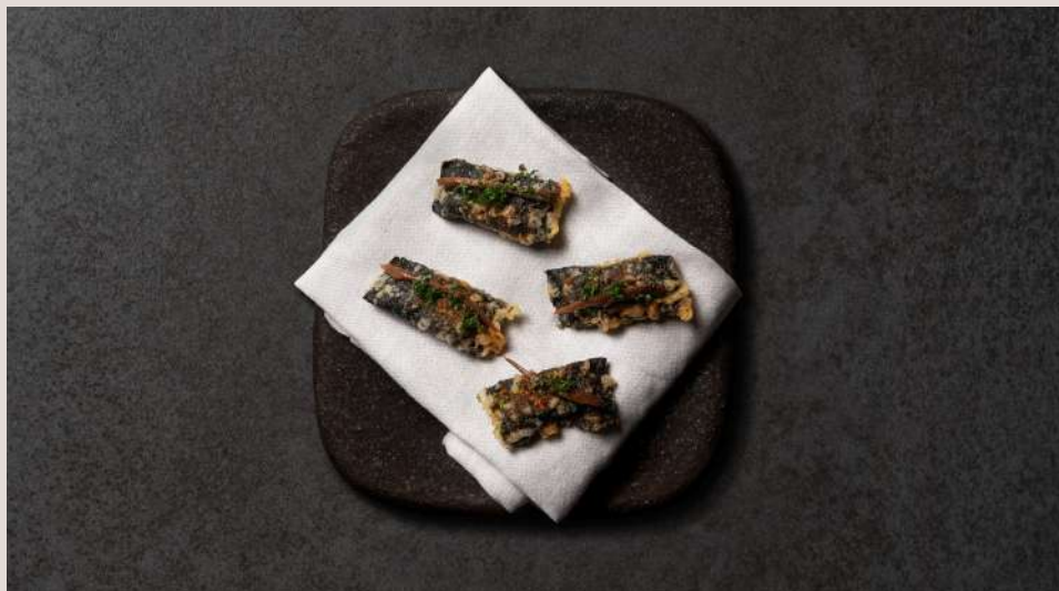
Nori & Ricotta Fritti, Anchovy, Lemon