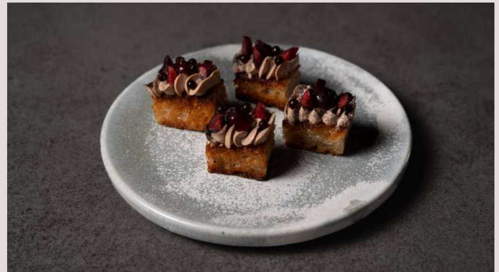
Whipped Liver Toast, Brand, Balsamic & Cherry