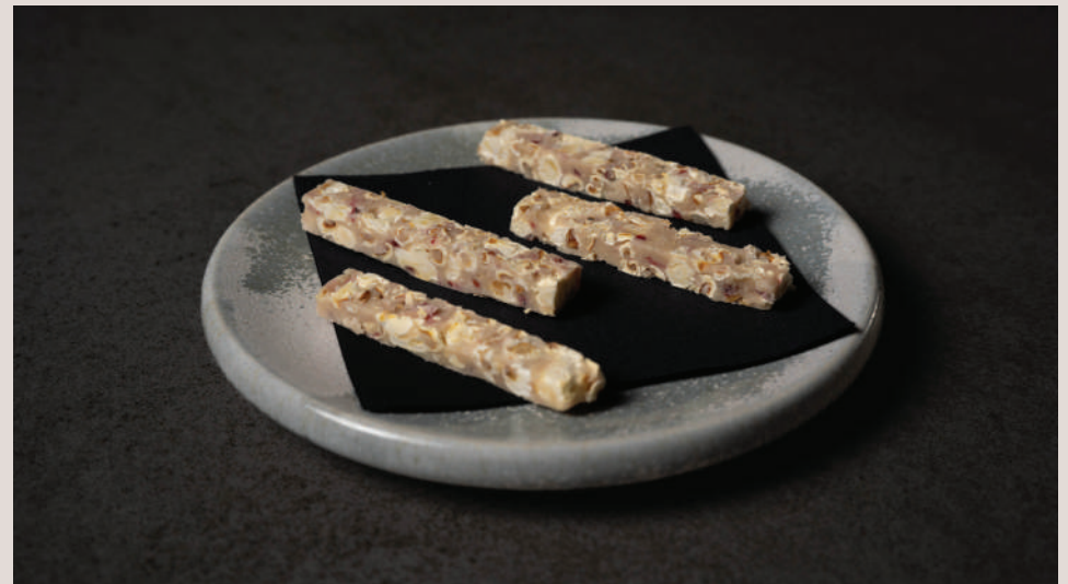
Salted Popcorn, White Chocolate & Cranberry Bar