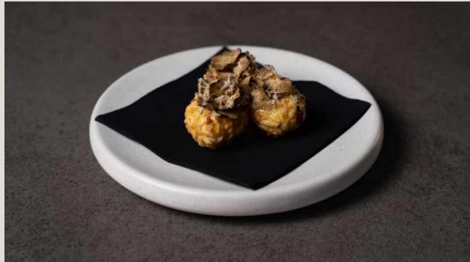
Orzotto & Smoked Pancetta Arancini, Shaved Comté & Truffle