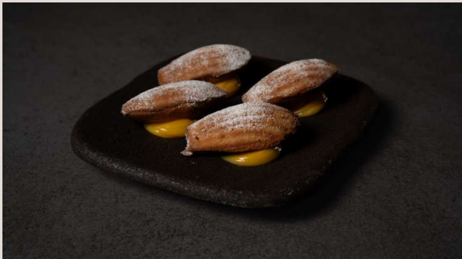
Freshly Baked Madeleines, Passionfruit Curd