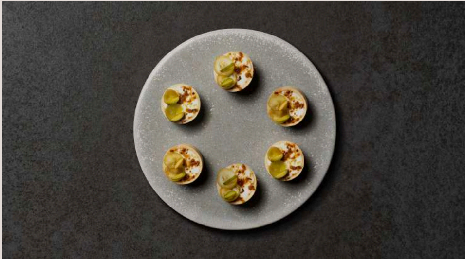
Stracciatella Tartlet, Grapes, Vadouvan, Pistachio