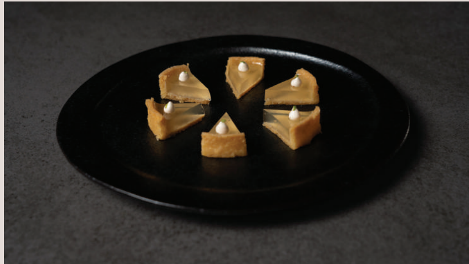
Clear Lemon Tart, Meringue