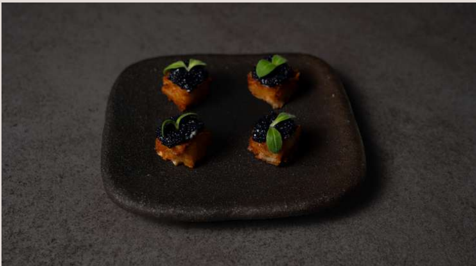
Hashbrown, Lumpfish Caviar, Wasabi Cream