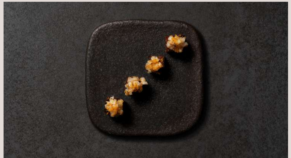
Torched Hokkaido Scallop & Bottarga Toast