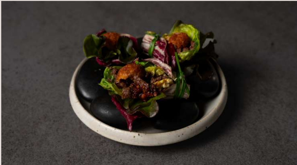
Leaf and Herb Wrap, Torched Aged Steak, Pomegranate Nuoc Cham, Crispy Rice