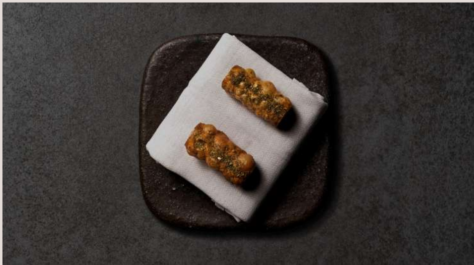
Burnt Aubergine, Seaweed Zaatar Cigar