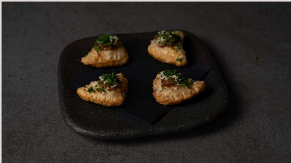
Maize Dumpling, Smoked Cheese, Caramelized Onion, Juniper Berry