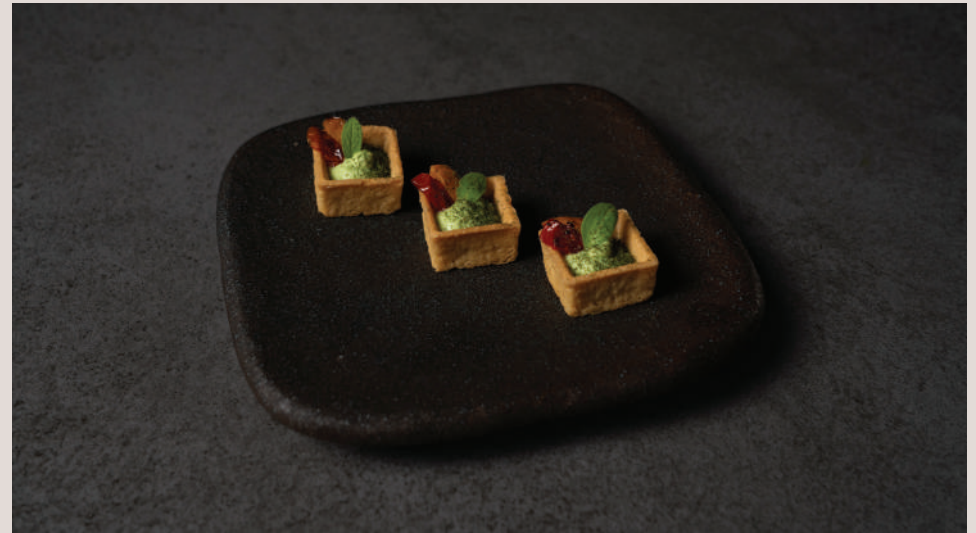
Green Pea, Tomato & Yuzu Tartlet