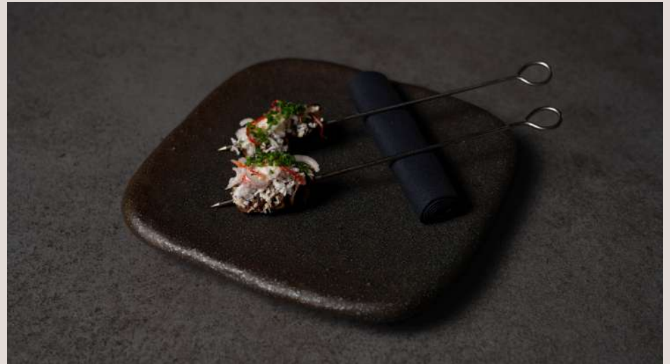
BBQ Chicken Hearts, Coconut Sambal