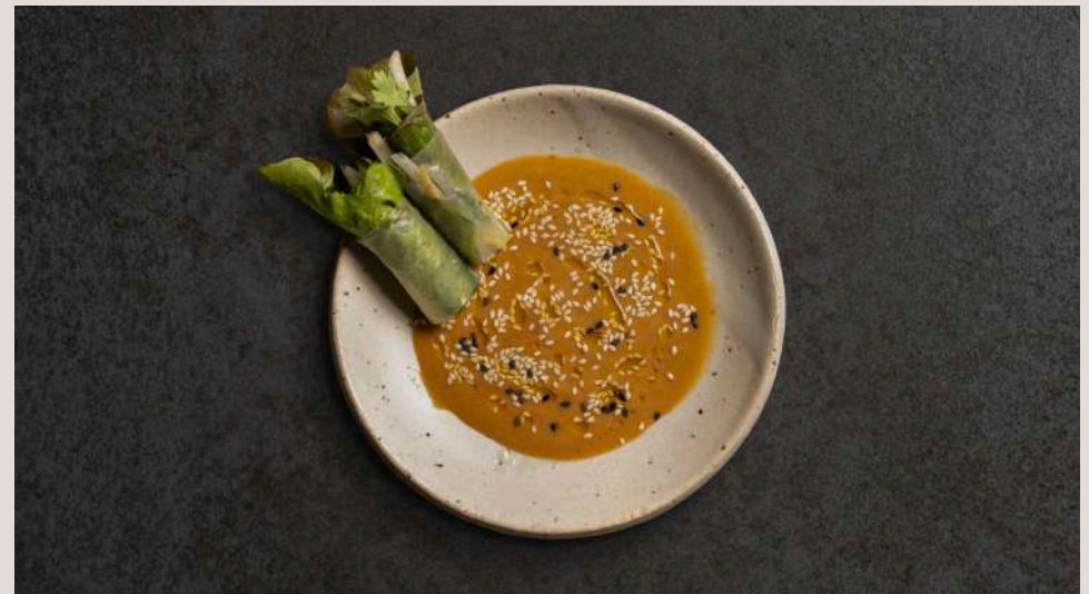
Summer Roll of Bitter Lettuces, Avocado, Wafu Dressing