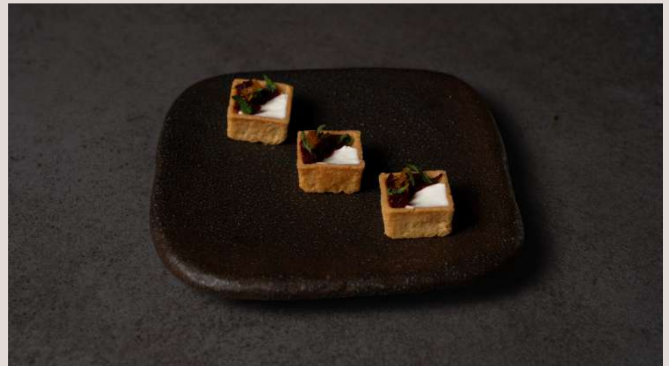
Beetroot Burnt Ends, Labne, Cumquat