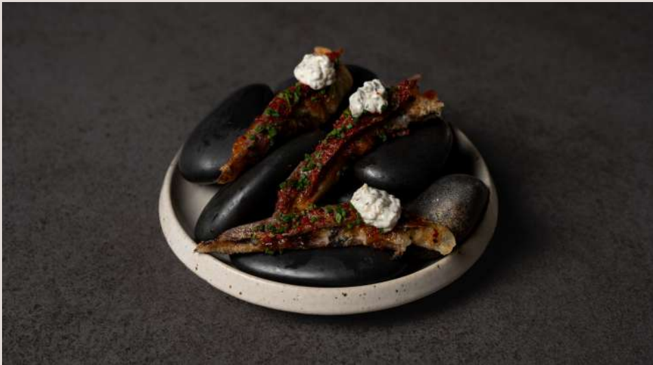
Anchovy, Hot & Sour Eggplant, Zuni Tzatziki