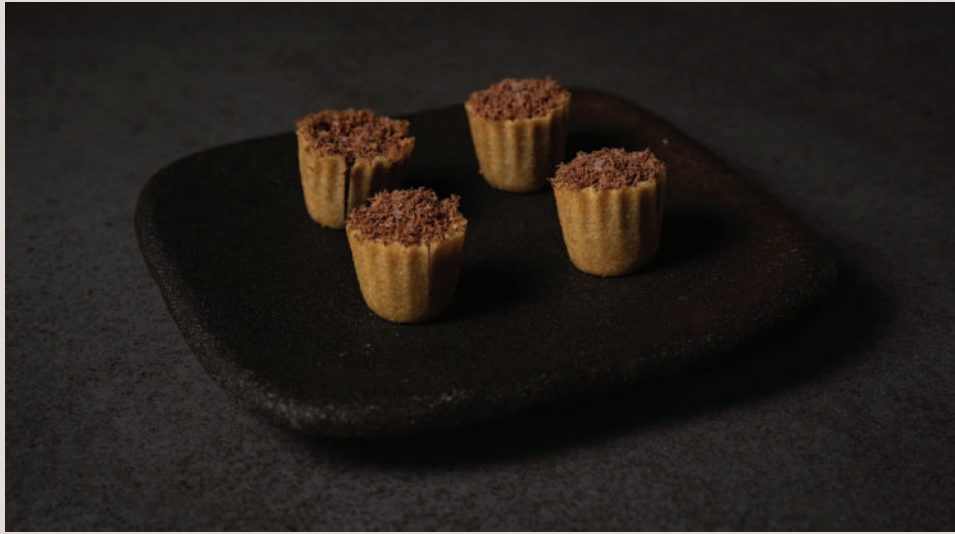
Dark Salted Chocolate, Cacao Shavings