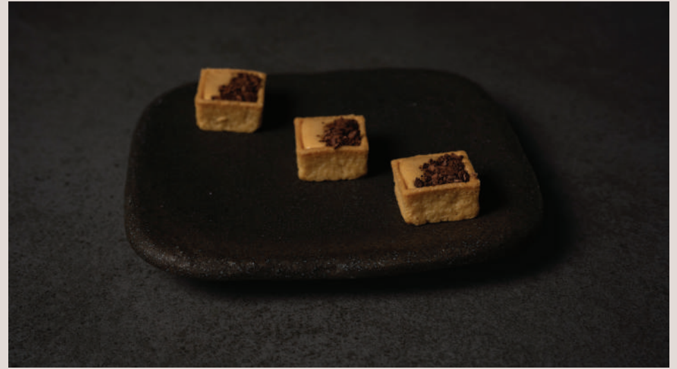
Peanut Parfait, Chocolate, Miso