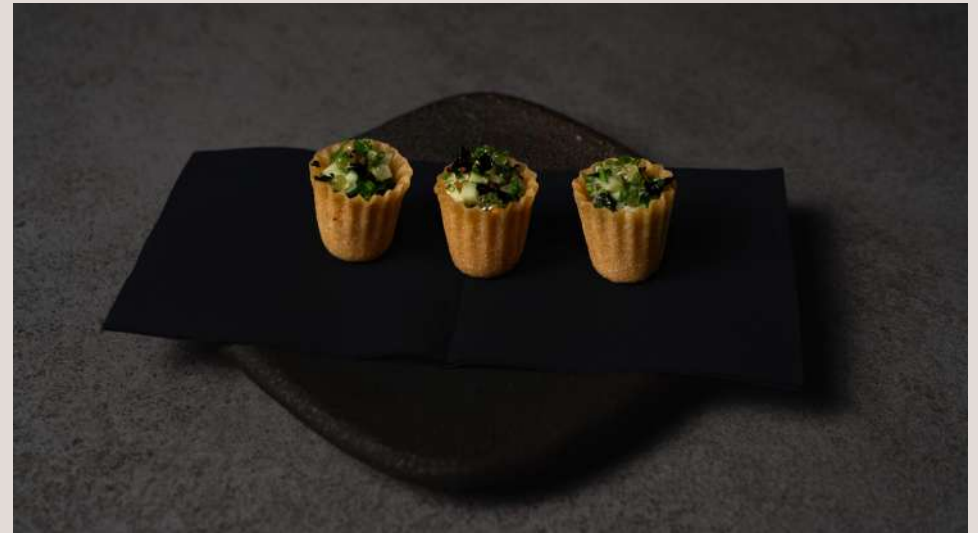
Raw Fish, Crispy Shell, Tarama, Cucumber, Kombu Mignonette