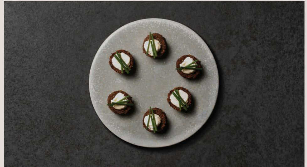
Falafel, Whipped Sheep's Feta, Green Onion