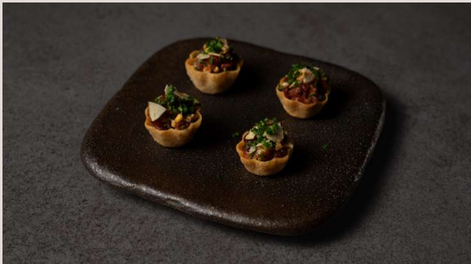
Beef Tartare, Gochujang, Soft Onions, Smoked Cream, Potato Chip