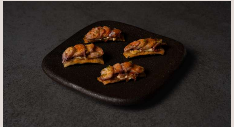
Pickled Octopus Tostada, Shirazi Salsa