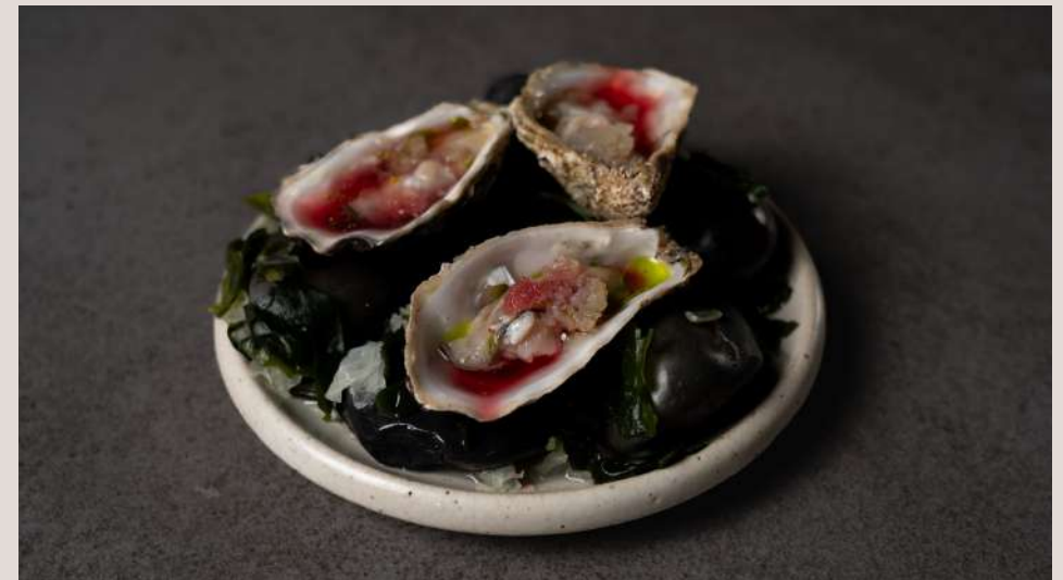
Local Oysters, Onion & Shiso Granita