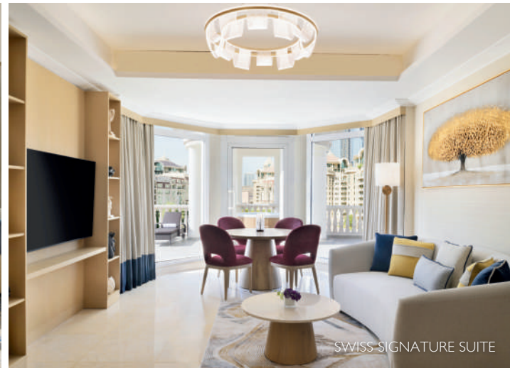
SWISS SIGNATURE SUITE