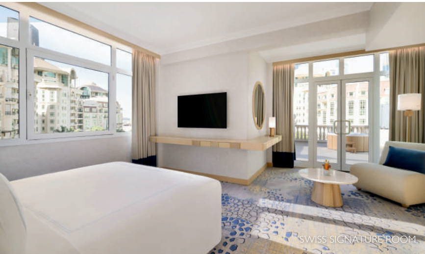
SWISS SIGNATURE ROOM