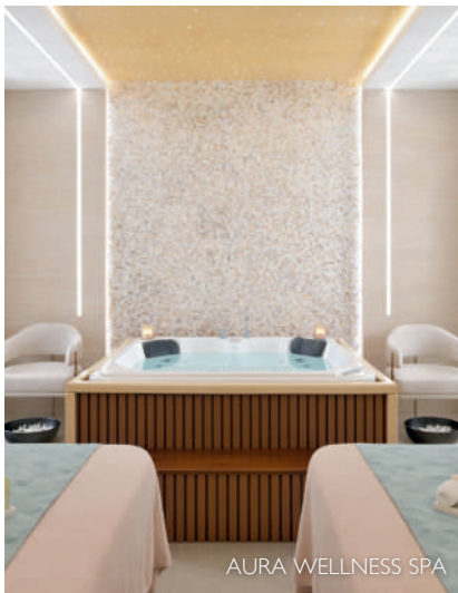
AURA WELLNESS SPA

Everything you need to conduct your business remotely and effectively such as a conference room for up to 10 people boardroom style. Services include high-speed internet, photocopying, typing, fax, binding and printing.