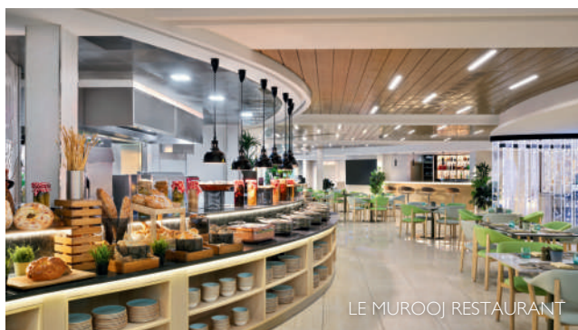
LE MUROOJ RESTAURANT

Discover a wealth of dining with plenty of personality at Swissôtel Al Murooj Dubai, each restaurant boasts its own unique theme and unrivalled cuisine for every palate. The hotel's 5 F&B outlet include Le Murooj, our all-day dining restaurant serving a wide choice of international dishes at a daily buffet service. Double Decker british themed pub packed with character. A menu brimming with traditional pub favourites and British hops has long been a hit with Dubai residents in search of a taste of home. Anees Pool Bar is the natural option for those enjoying leisure time by the hotel's pool with the menu full of favourite bites, sandwiches, salads and daily specials, making this a favourite pool bar in Dubai. For daily escape for coffee and snacks - Circle or Ojos café will be the best spot.