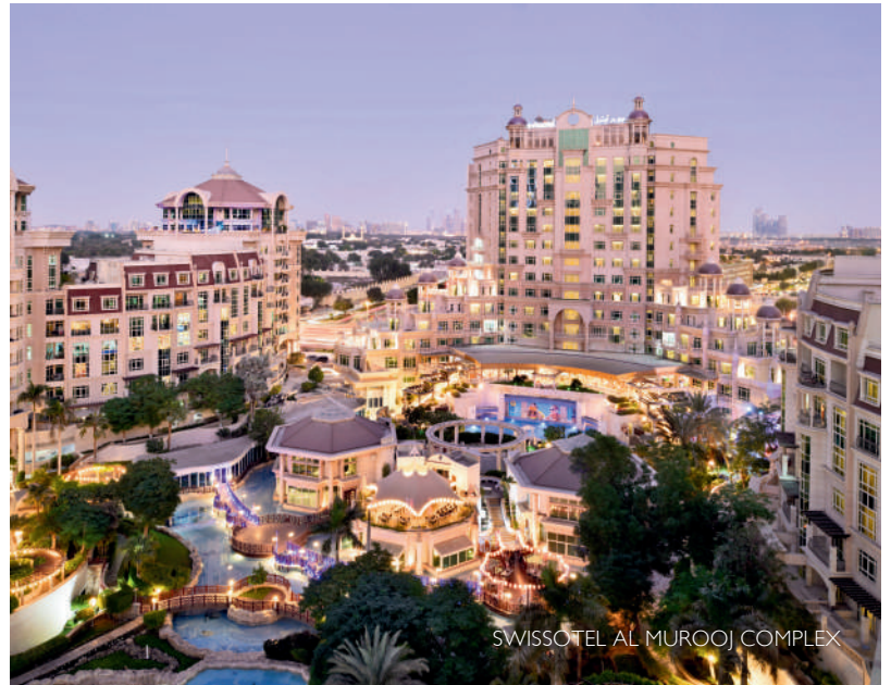
SWISSOTEL AL MUROOJ COMPLEX

Step into a world of ease, luxury and Swiss hospitality at Swissôtel Al Murooj located in the city's favoured destinations for business or leisure. Directly opposite The Dubai Mall, one of the largest malls in the world, the iconic Burj Khalifa and within a few minutes' drive to Dubai International Financial Centre and World Trade Centre with its many exhibition halls. The unique urban-style feel and ambiance at Swissôtel Al Murooj Dubai cleverly combines hotel and apartment style accommodation, arranged around a central leisure complex.