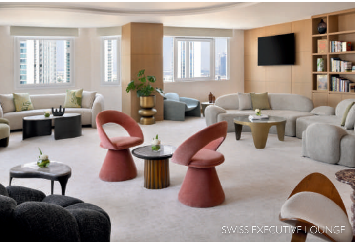
SWISS EXECUTIVE LOUNGE