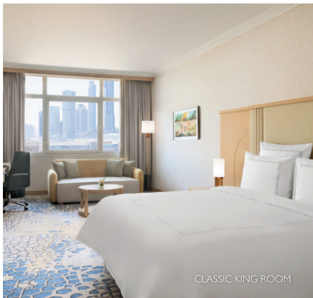
CLASSIC KING ROOM