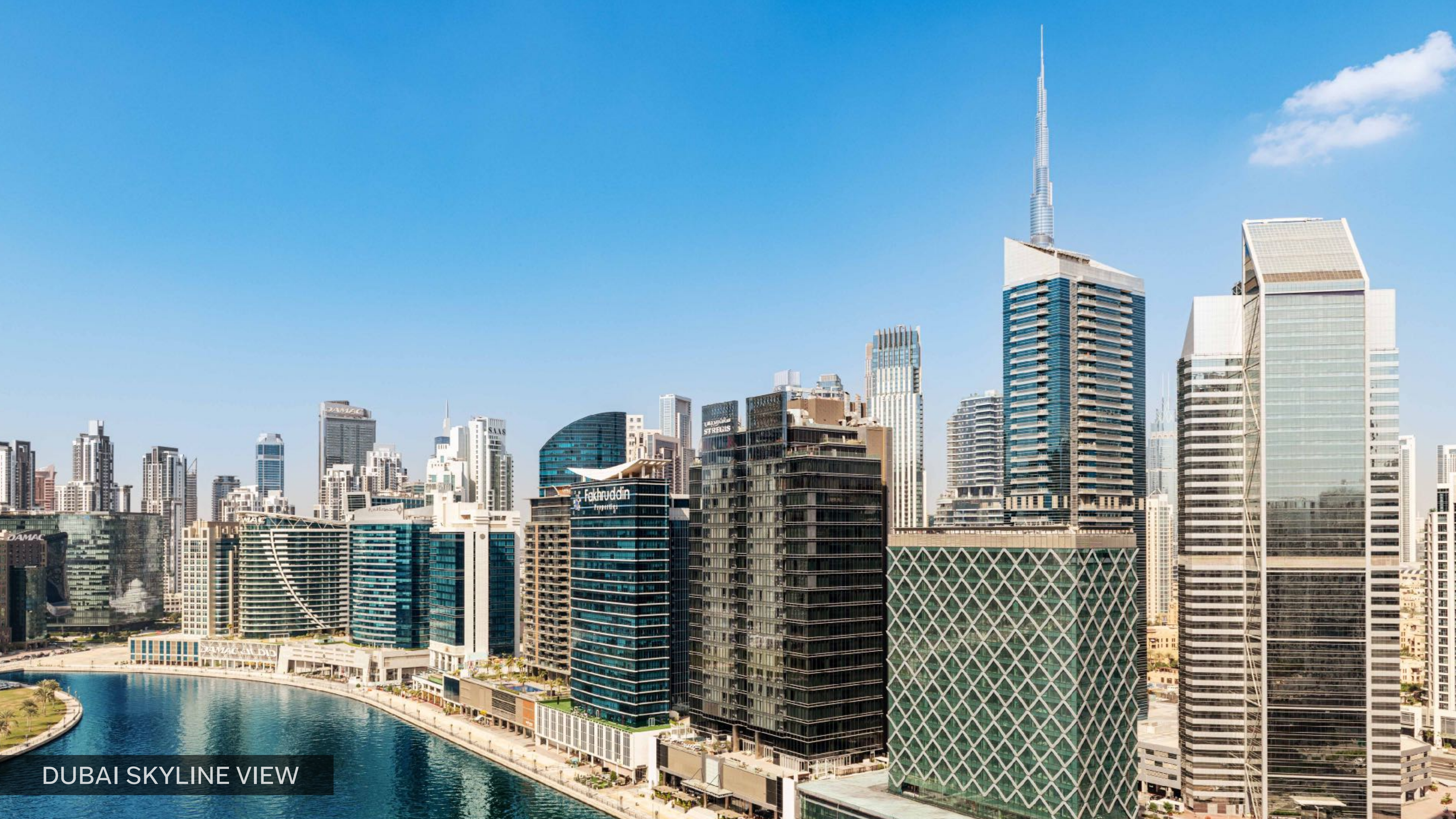
DUBAI SKYLINE VIEW