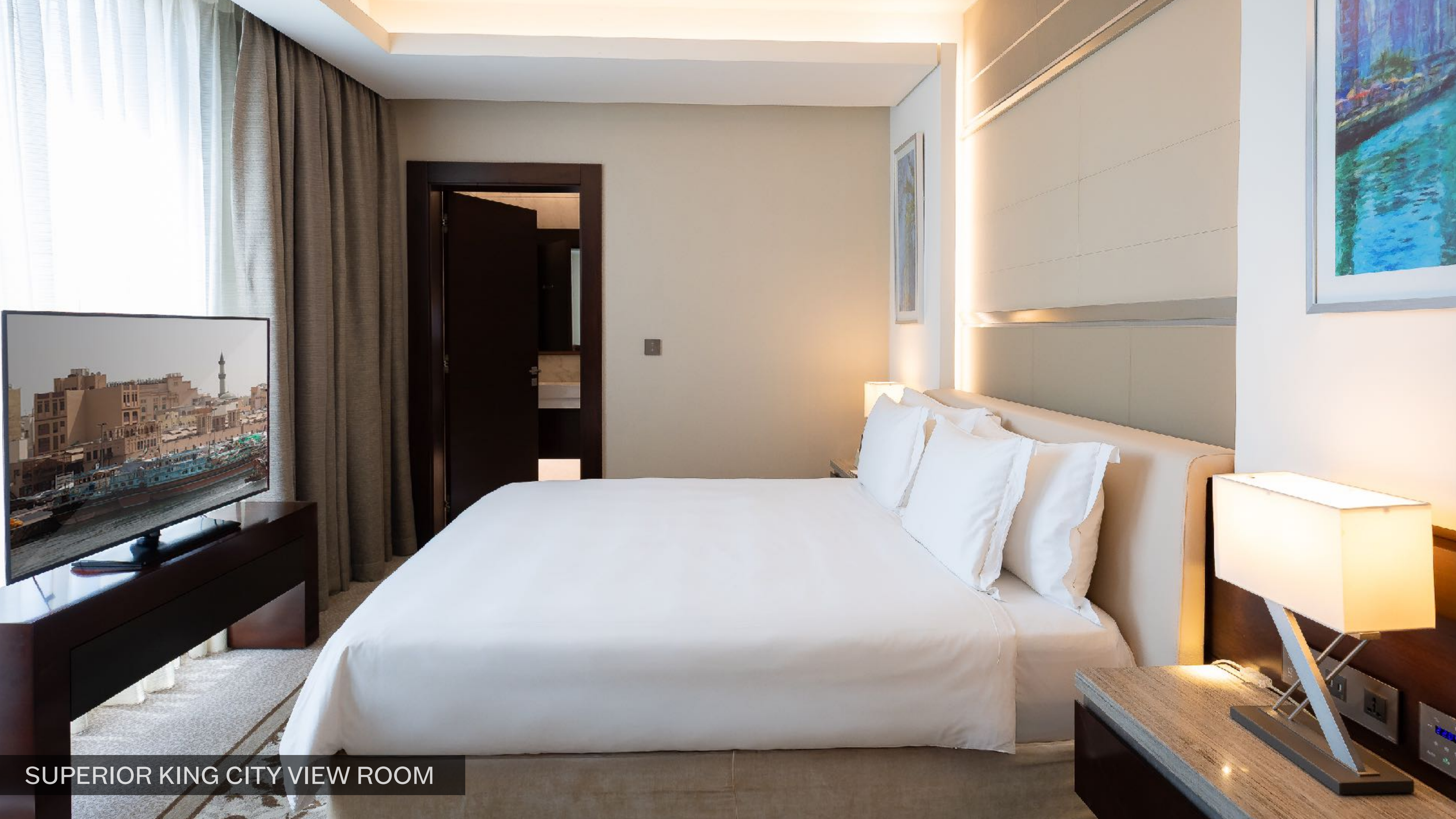
SUPERIOR KING CITY VIEW ROOM