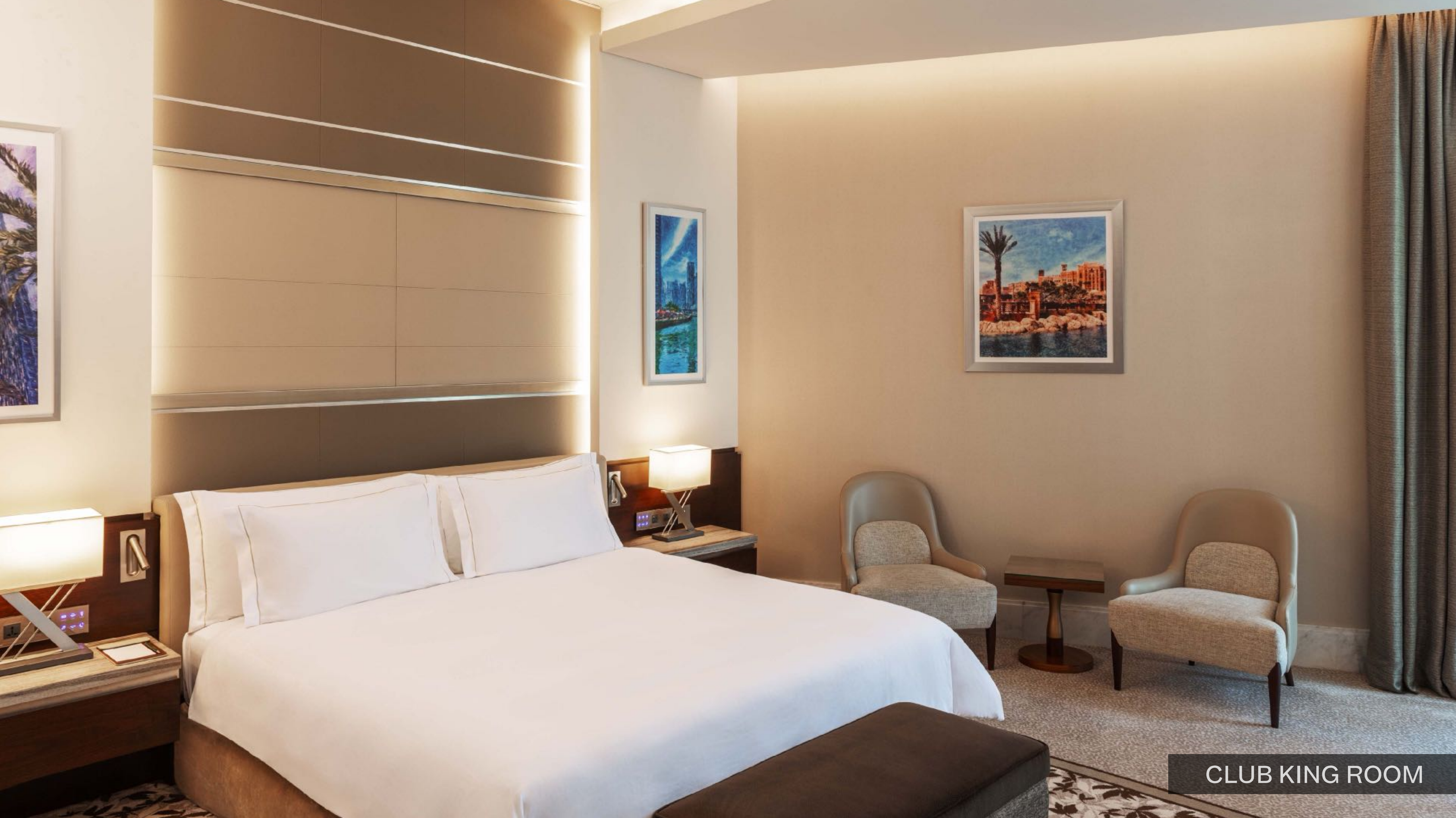
CLUB KING ROOM