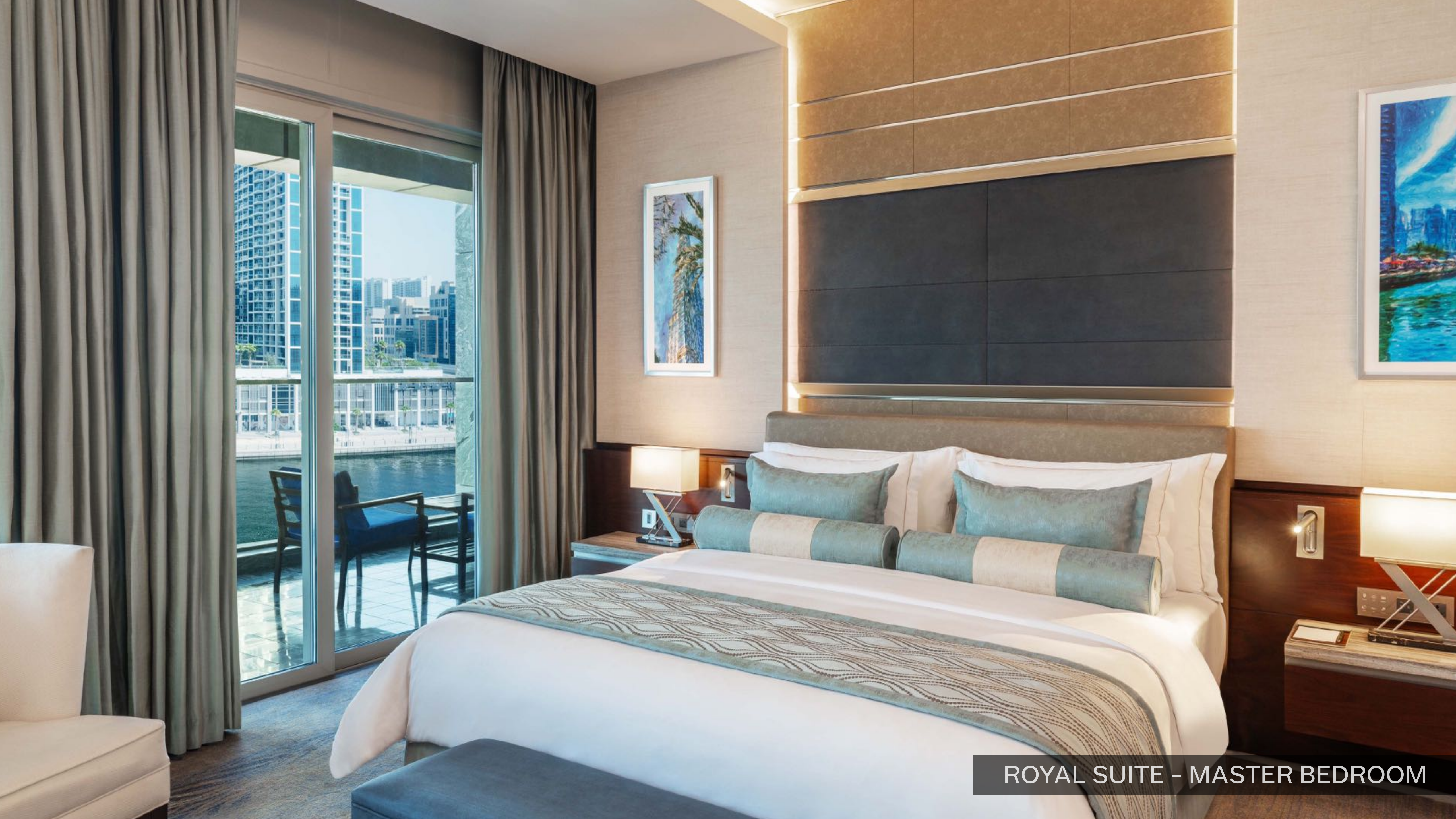
ROYAL SUITE - MASTER BEDROOM