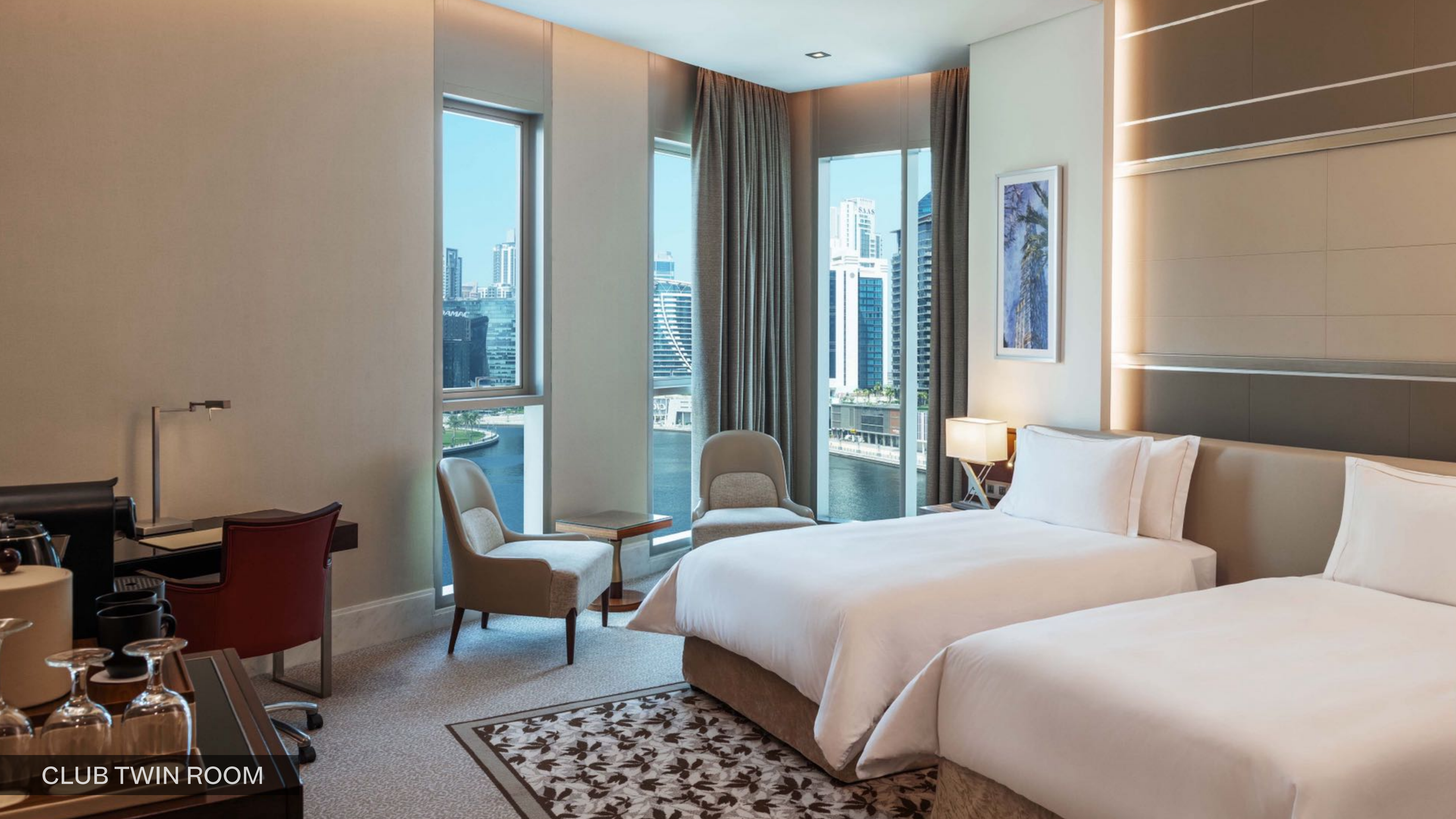
CLUB TWIN ROOM