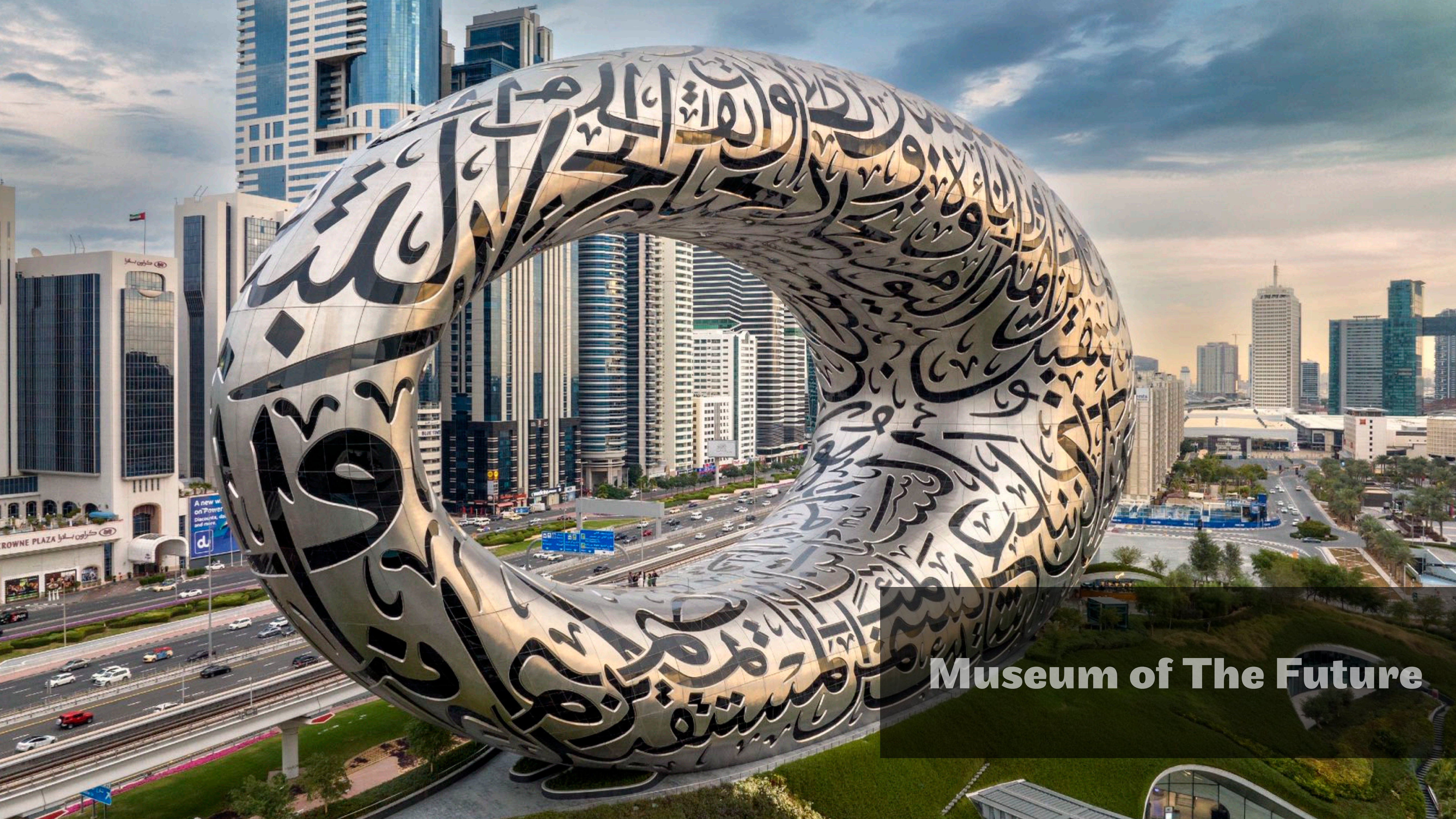
Museum of The Future