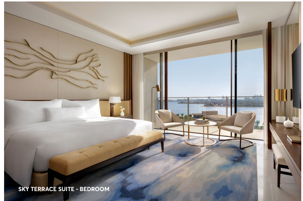
SKY TERRACE SUITE - BEDROOM