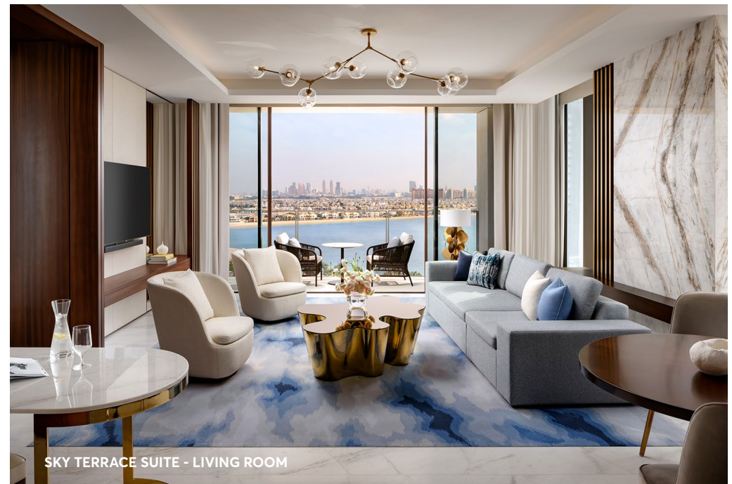
SKY TERRACE SUITE - LIVING ROOM