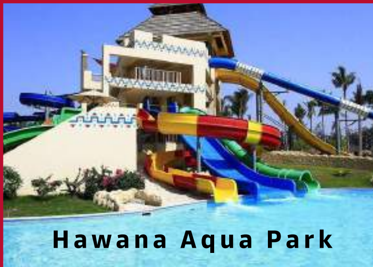
Hawana Aqua Park