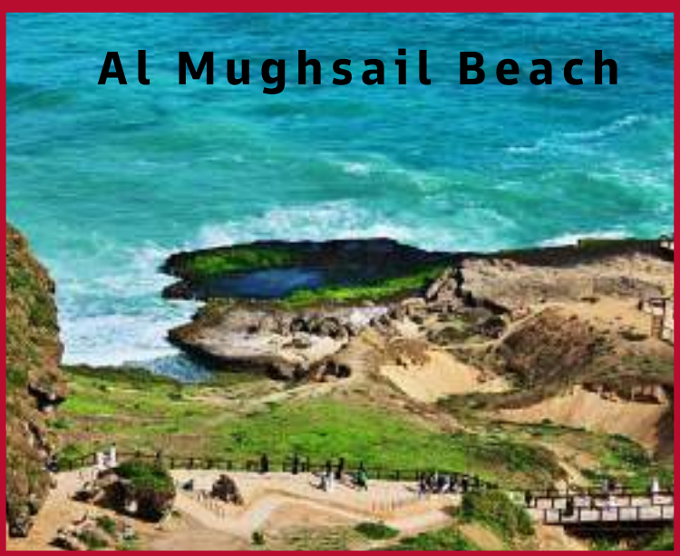
Al Mughsail Beach