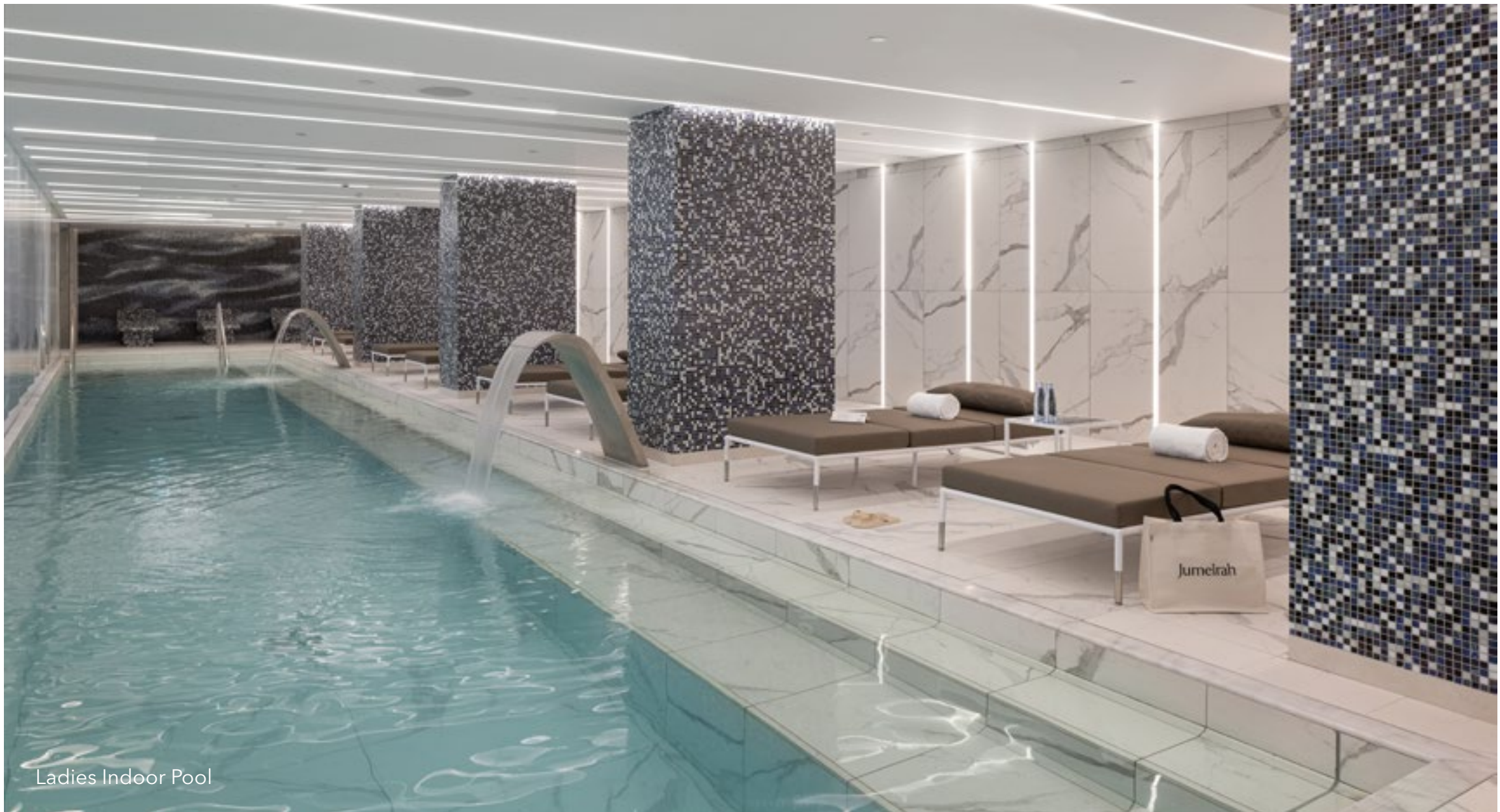
Ladies Indoor Pool