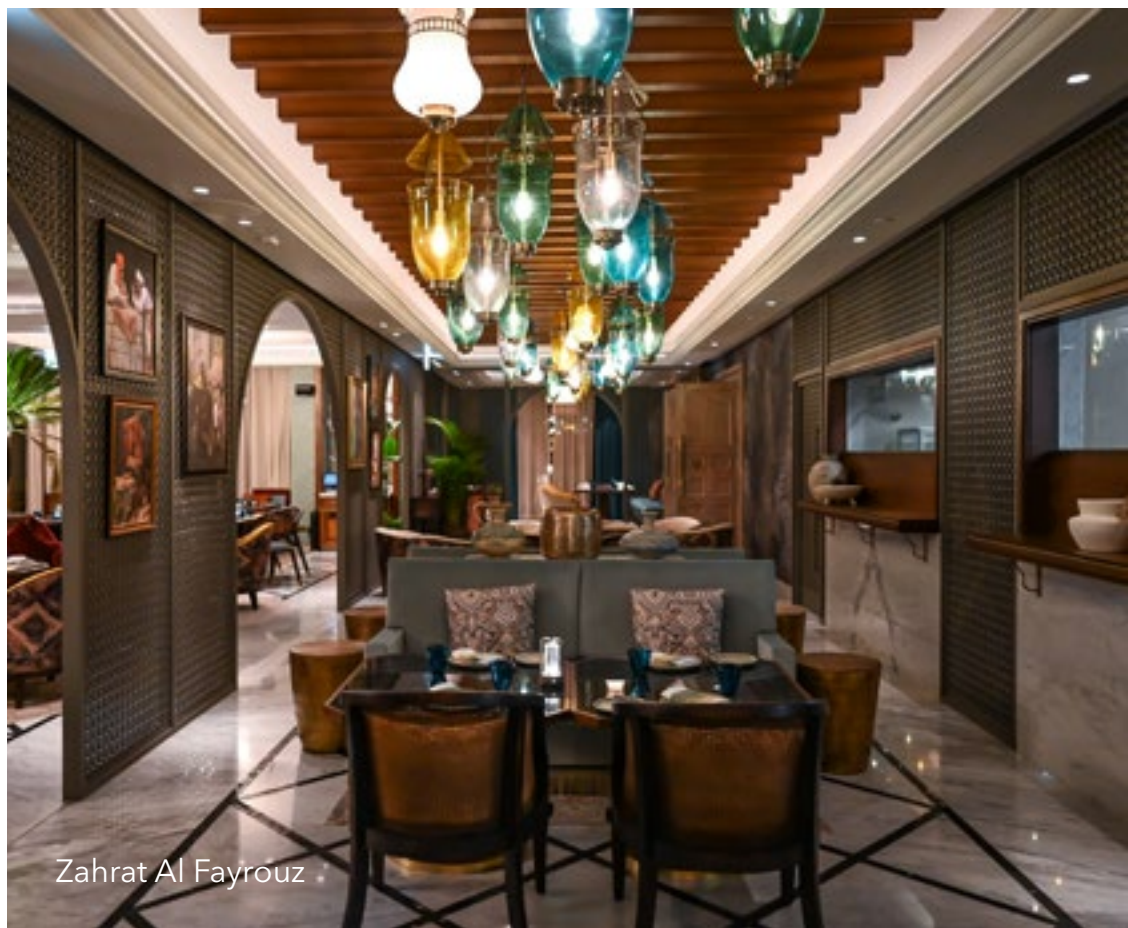
Zahrat Al Fayrouz