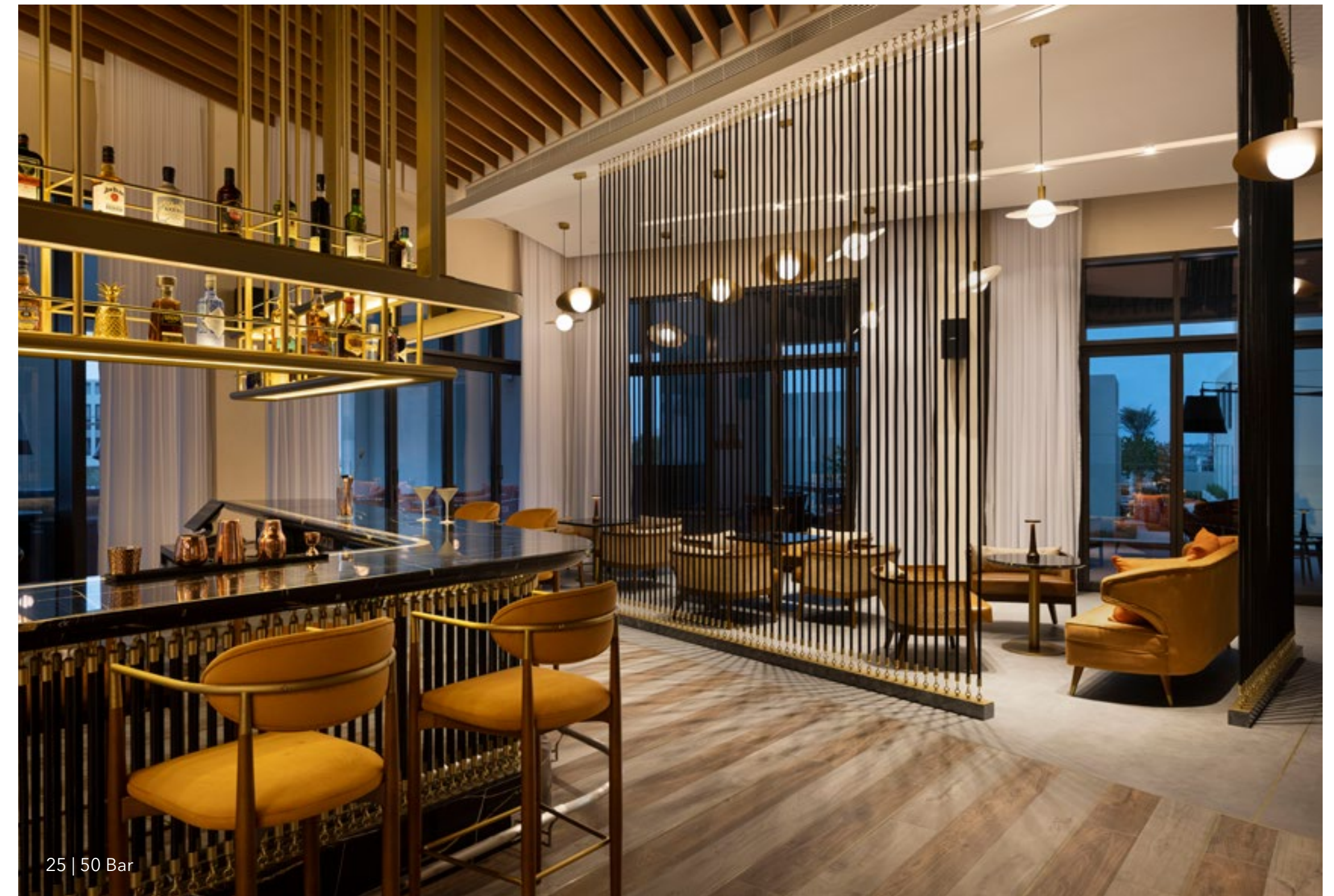
25 | 50 Bar

A destination to experience a unique atmosphere while enjoying traditional shisha, delicious snacks and refreshing drinks. overlooking the sparkling Gulf, the outdoor setting area is the perfect spot to relax and unwind with friends and family. Whether you're a sports fan or simply looking for a place to relax and socialize, this lounge has something for everyone.