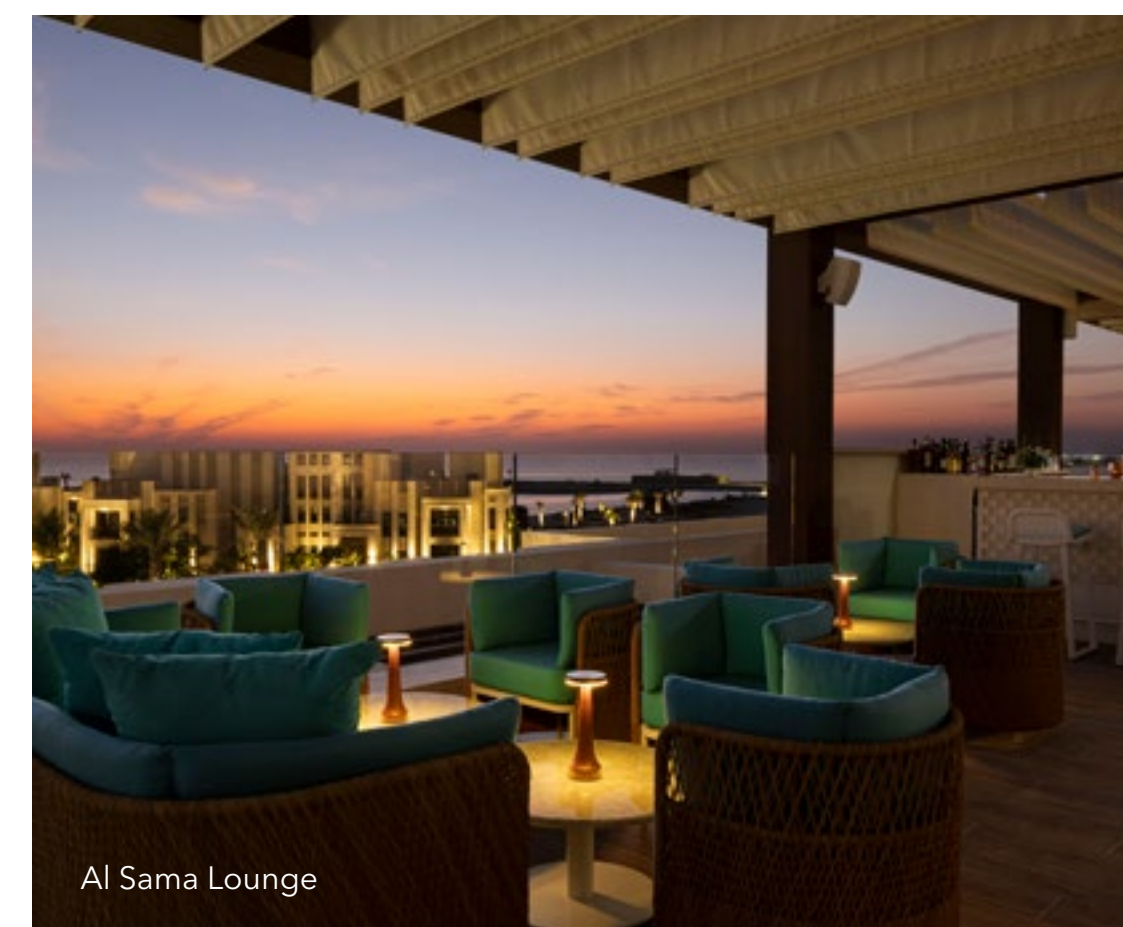
Al Sama Lounge