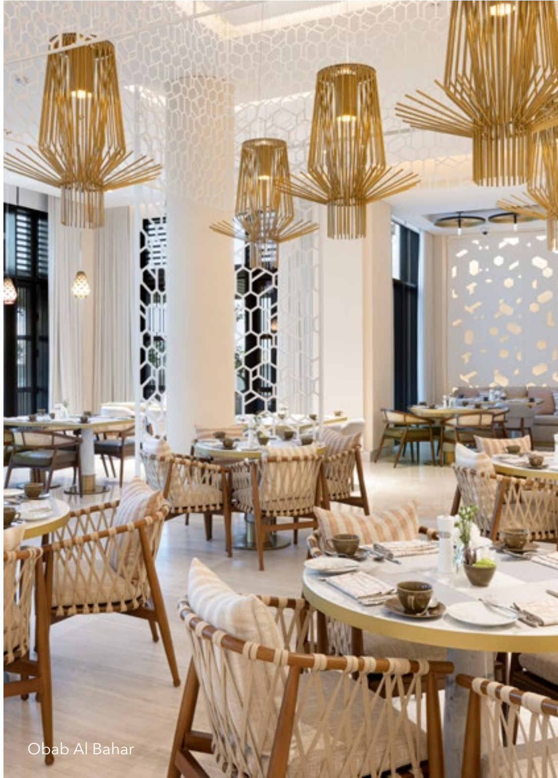
Obab Al Bahar