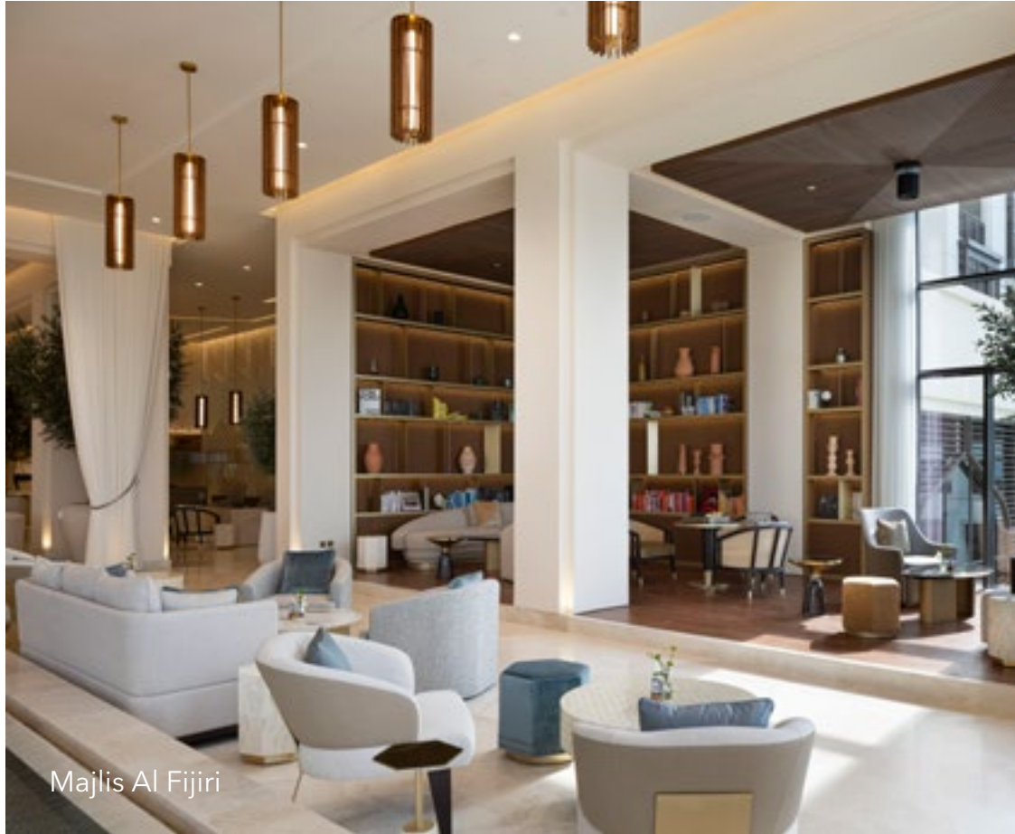
Majlis Al Fijiri

As part of Jumeirah’s signature dining experiences, the resort features six striking venues which offer a mixture of international flavours curated by world-renowned chefs.