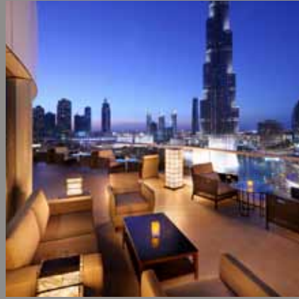
The Cigar Lounge