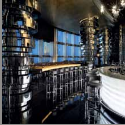
Neos Sky Lounge