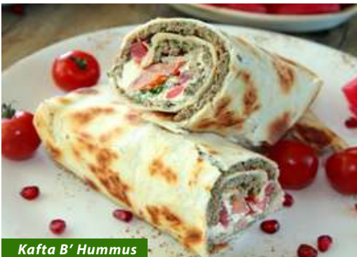
Kafta B' Hummus