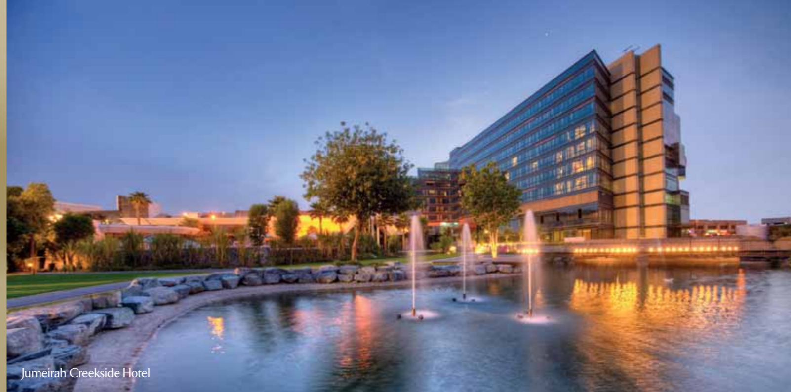
Jumeirah Creekside Hotel