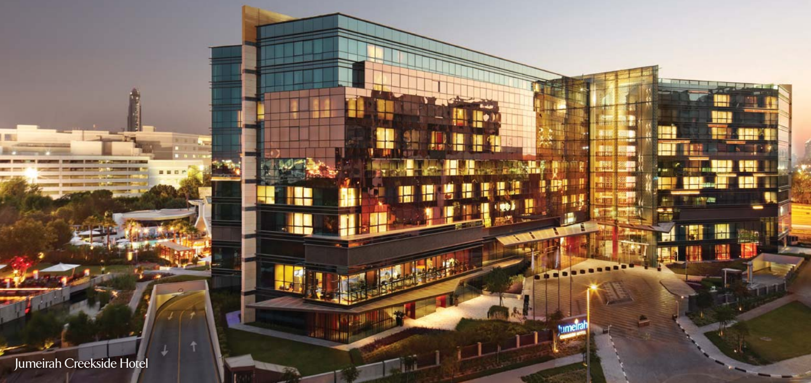
Jumeirah Creekside Hotel