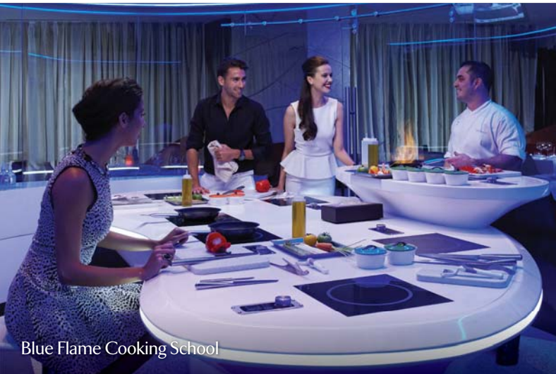
Blue Flame Cooking School

Embark on a culinary journey beyond imagination.